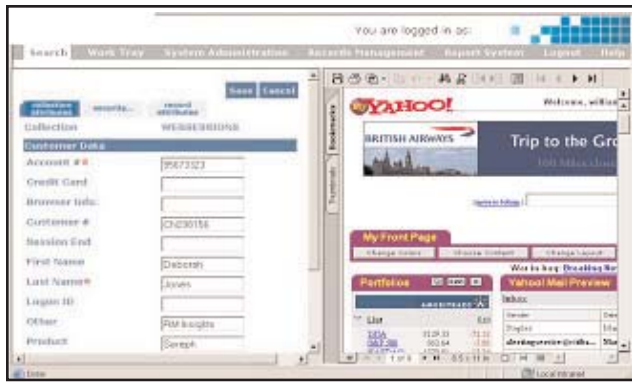
Figure 1. Web Page Transaction Retrieval